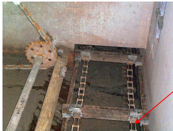
Grit Chamber Scraper Apparatus

Treating water from Lake Michigan, the Jardine Water Purification Plant pumps over 700 million gallons of water per day. Grit Chambers are large settling tanks where the removal of organic solids takes place. The large tanks have chains and sprocket systems with scrapers or flytes spaced at intervals between them. Scum is removed from the top and the grit and settled solids are scraped to one end of the bottom of the grit chamber for removal. The existing UHMWPE wear shoes are the wear surface for the slow moving scrapers and have been problematic for this application. There are over 14,000 wear shoes at this plant in 3 different sizes.