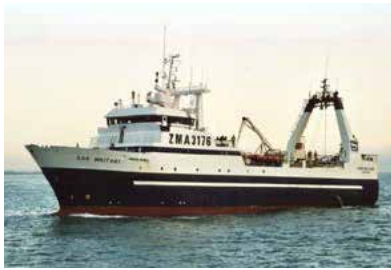
FV San Waitaki

The FV San Waitaki has conveyors onboard the vessel that are used in handling fish. The conveyor and its many components, including the bearings are exposed to abrasives such as salt water and the debris from the nets. The existing nylon bearings showed excessive wear resulting in the need to grease them every 2 weeks, and had to replace them every 3 to 4 weeks.