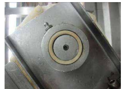
Greaseless Thordon SXL bearing