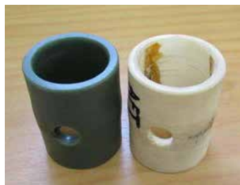
Left: Existing Nylon bearing Right: Thordon SXL bearing

In early 2015, Thordon grease-free SXL bearings were supplied as the replacement for greased nylon bearings in the conveyors.