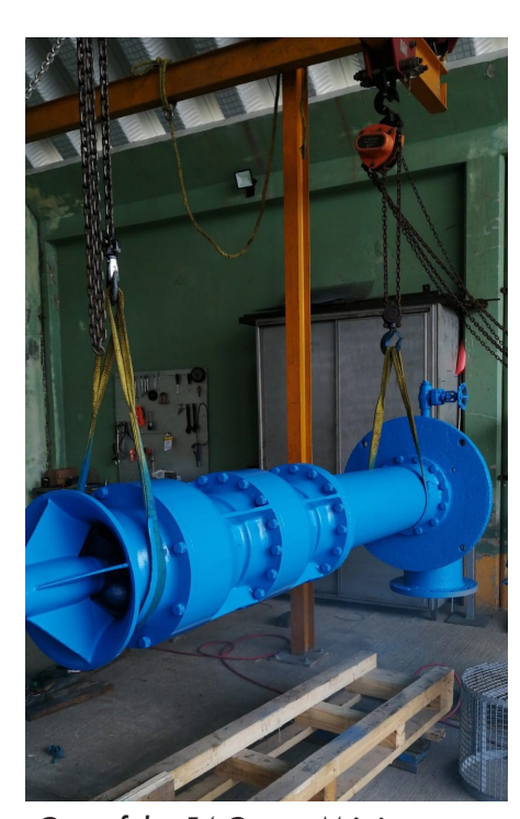
One of the 54 Grupo México pumps that is now fitted with Thordon's ThorPlas-Blue bearings

TZ Industrias expects to retrofit an additional 189 pumps over the next 2 years.