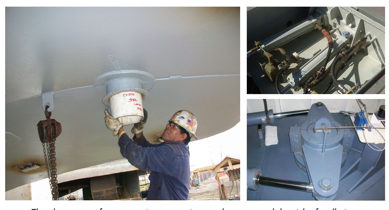
Thordon grease-free operation saves time and money and the risk of pollution.