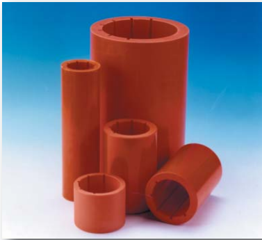
COMPAC: Thordon's premium and lowest friction bearing for blue water application

Thordon offers different propeller shaft bearing grades for different yacht operating profiles.