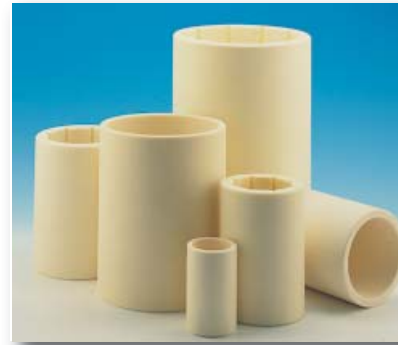
SXL: Low friction bearing for yachts operating up to 20% of the time in abrasive water

Consider these propeller shaft bearing performance benefits: