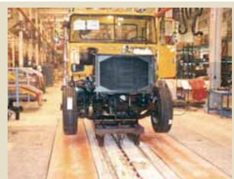
Typical Washline Roller Conveyor Bearings

End User: Automobile Manufacturer, U.S.A. Application: Washline roller conveyor bearings Application Details: Bearing sizes: 44.5 mm (1.75") x 31.8 mm (1.25") x 38.1 mm (1.50") Radial pressures: ~ 10.3 MPa (1500 psi) Wet, dirty greased application Installation Date: December 2004 Note: ThorPlas® eliminated greasing and second order placed