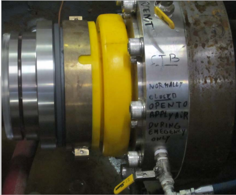
Starboard seal installed