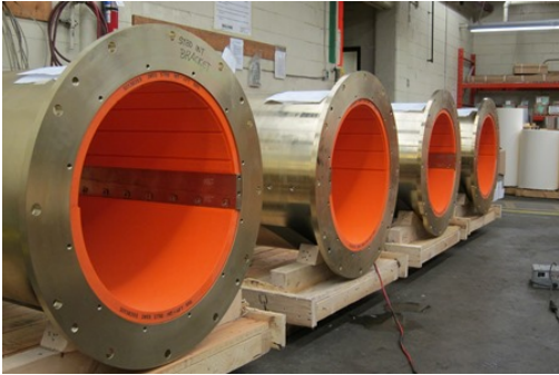
Right: Six COMPAC water-lubricated propeller shaft bearings will be supplied to Fincantieri for installation to MSC Seaside