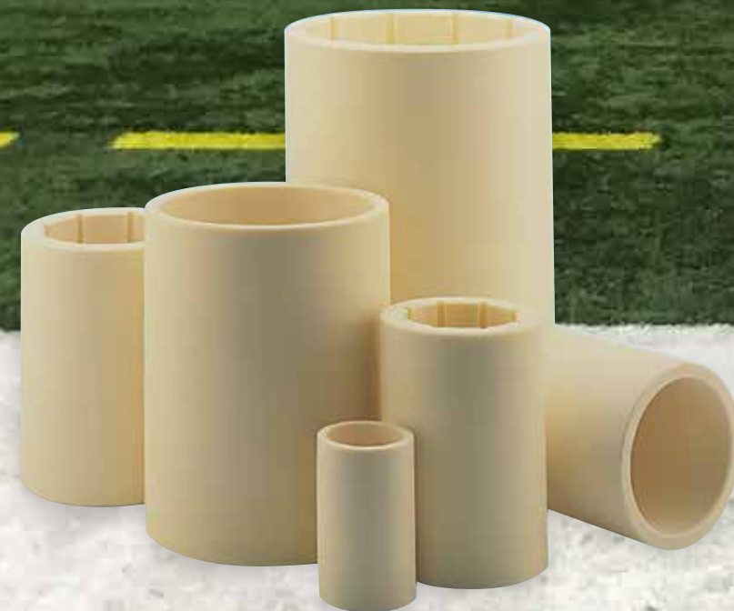
Thordon's Jim Bright (left) and Scott Groves (right) onsite at the Superdome after installation

The Superdome in New Orleans, Louisiana improved their pump efficiency by using SXL bearings after they installed variable frequency drives (VFD) on their cooling water pumps. The abrupt start and stop was tough on the pumps which led to the Superdome's decision to opt for the variable frequency drives. The slow start and lack of consistent shaft speed with the VFDs led to increased periods of dry running causing the strain and eventual failure of the existing pump bearings.