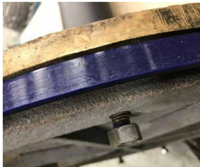
Thor-Flex seals installed in refurbished pneumatic cylinder

Thor-Flex is an elastomeric polymer material with high mechanical strength, along with self-lubricating properties making it highly suitable for cylinder seals in challenging environments. Thor-Flex offers superior yield strength to other seals on the market, and have a high resistance to permanent deformation. They can safely operate in temperatures from -50°C to +90°C (-60°F to 195°F), and at pressures up to 103,421 kPa (15,000 psi). They are able to work in abrasive, corrosive environments at high levels of humidity and can resist high impact loads.