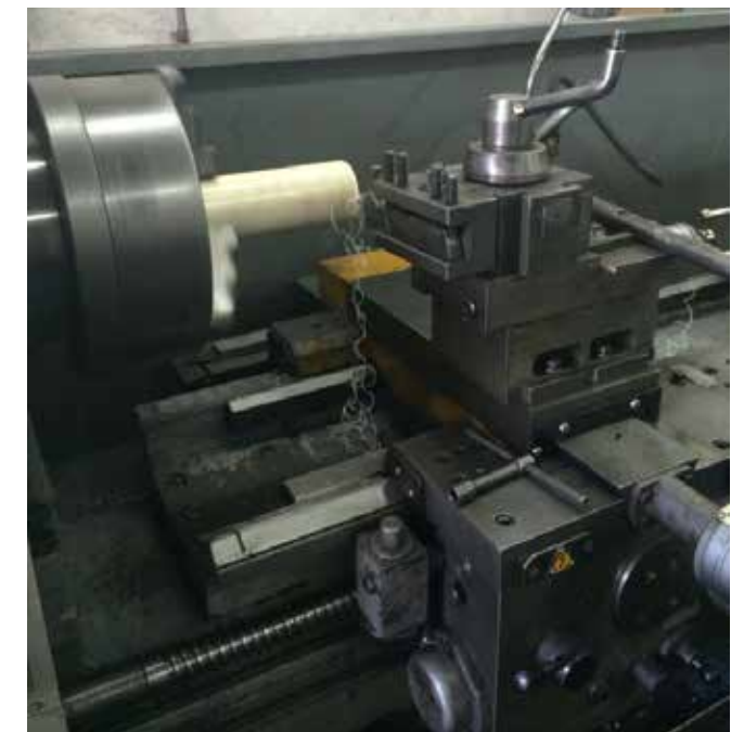
Thordon SXL tube stock being machined

"Wear life is the biggest advantage to using Thordon non-metallic materials, but also offers ease of use. We have the Thordon Bearing Sizing Calculation Program that makes it easy to determine correct finished dimensions, and they are easy to machine. There is no harmful dust when machining Thordon polymers which is a big advantage over phenolic bearings. And then when it comes to installation, we can freeze fit, press fit or bond fit, so there are other options there too," said Swanson. ☺