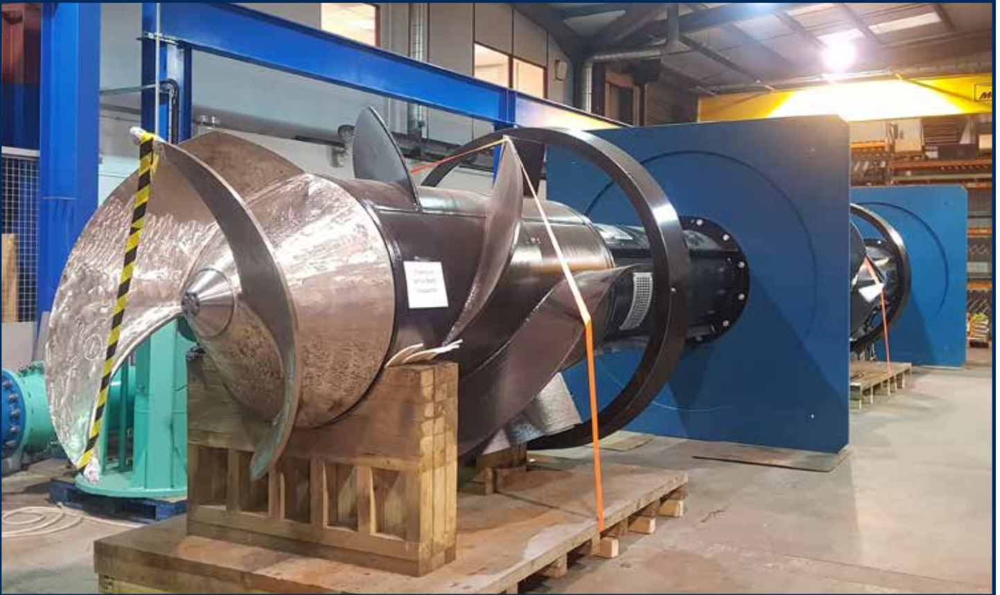
Bedford Pumps Ltd. new pump design fitted with Thordon SXL bearings