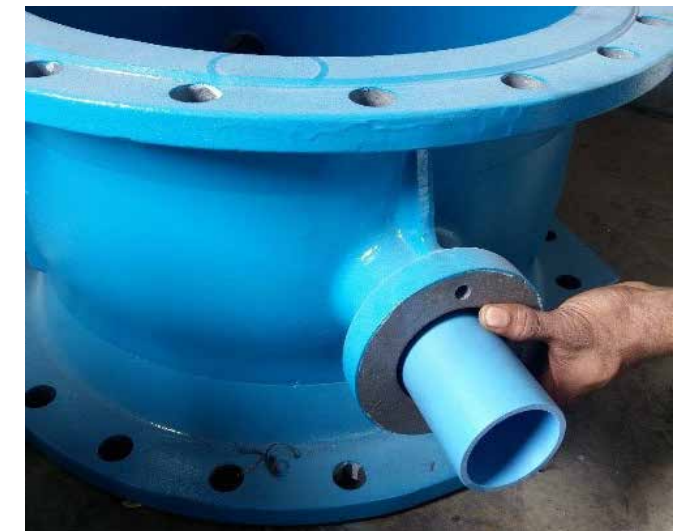
ThorPlas-Blue being measured for fit in a butterfly valve.