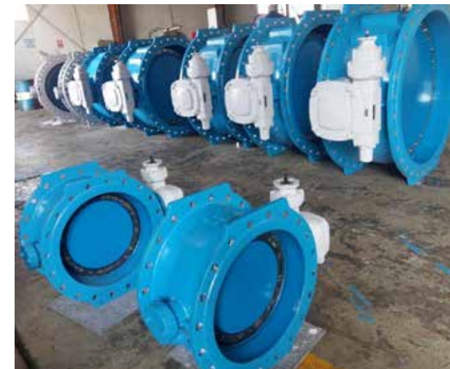
Brine recirculation pumps fitted with ThorPlas-Blue Bearings

DEWA currently has an installed capacity of 12,300 megawatts (MW) of electricity and 1.78 million Kiloliters (470 million gallons) of desalinated water per day, providing its services to over one million customers in Dubai. ☺