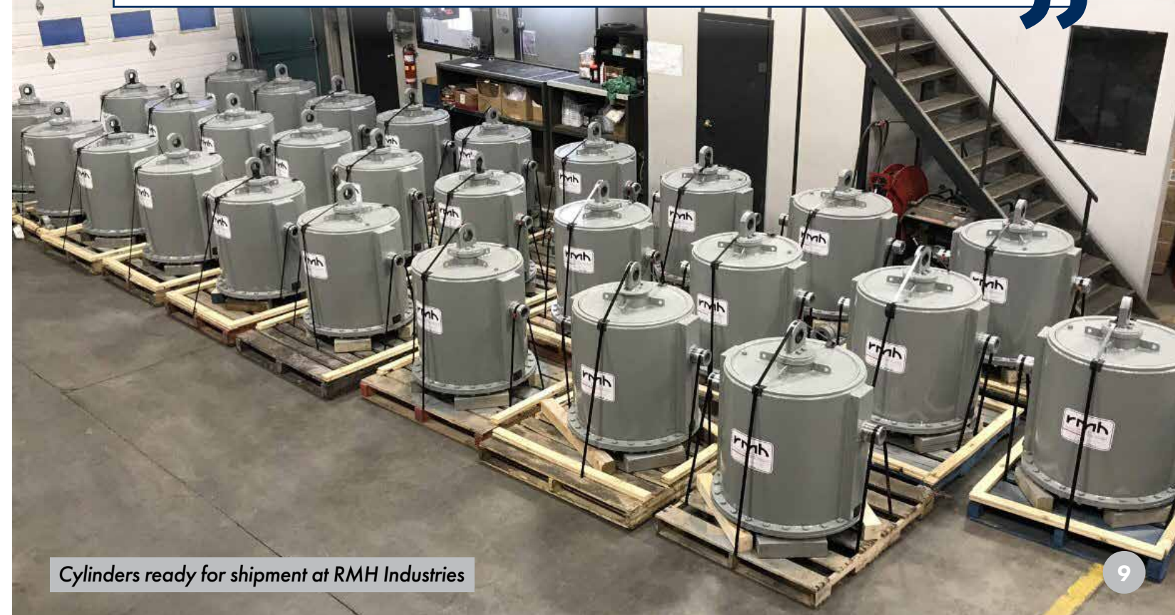
Cylinders ready for shipment at RMH Industries