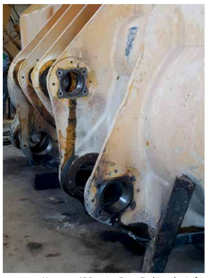
Komatsu 600 series Front End Loader in for maintenance where Thordon's ThorPlas-Blue bearings will be installed