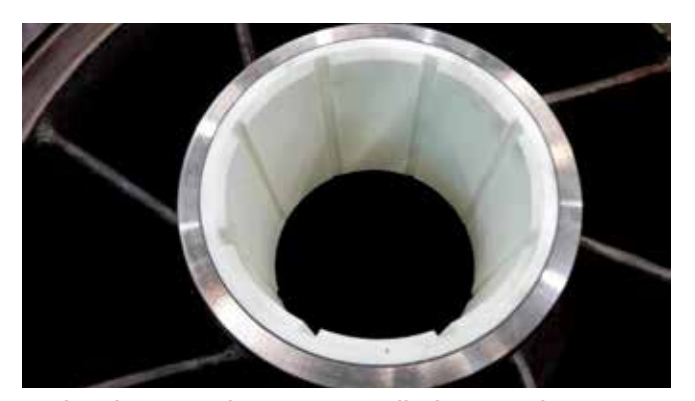
Thordon's SXL bearings installed in KSB three-stage mixed flow impeller-type pumps

Thordon Bearings' water-lubricated elastomeric polymer bearings have been installed to well pumps aboard an undisclosed offshore oil platform operated by Abu Dhabi National Oil Company (ADNOC).