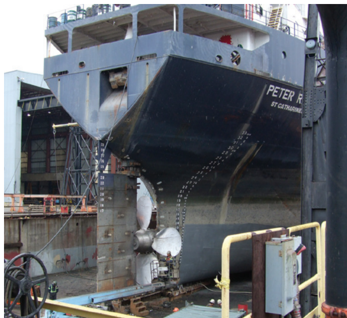
Peter R Cresswell dry-docking March 2010

become increasingly problematic. "The whole environmental issue became a source of grief with Transport Canada. As a company we are part of a collective programme to introduce green marine policies, extending across emissions, ballast water management, grey and black water discharges. It's pretty clear that the end game will be no discharges allowed at all, and we