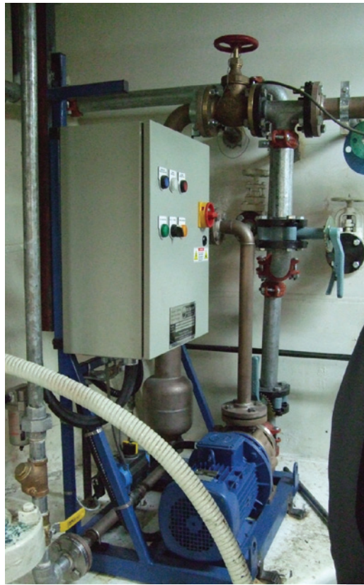
Thordon Water Quality Package provides a controlled environment and removes abrasives from the water improving bearing wearlife and ensure a constant flow of water

Mr. Davies added that selecting bio-degradeable oils did not offer a viable solution. "Bio-degradeables are considered a discharge because of the sheen they leave. Even using those products,