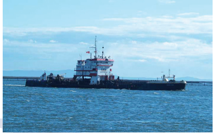
Triple screw dredger, Fraser Titan converted from oil to water lubricated propeller shaft bearings in 2011

The Fraser Titan has three shaftlines with diameters of 165 mm (6.6"). The Thordon RiverTough propeller shaft bearings operate in combination with hard coated Nickel-Chrome-Boron shaft sleeves which provide superior wear life in highly abrasive wear conditions experienced on the Fraser River in British Columbia. Water is used as a lubricant (instead of oil) and is taken