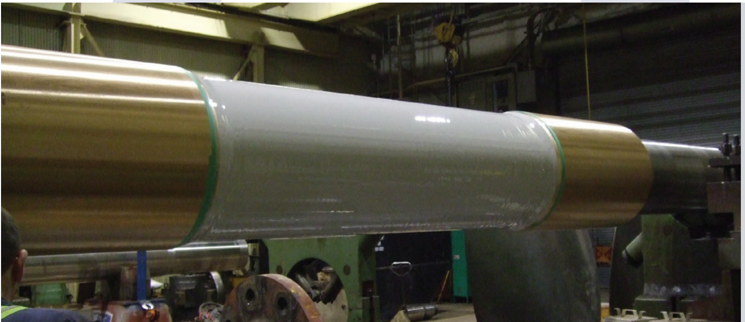
Thordon Thor-Coat shaft coating protects against corrosion

requires a review of the existing shafting and sterntube arrangement drawings, if available.