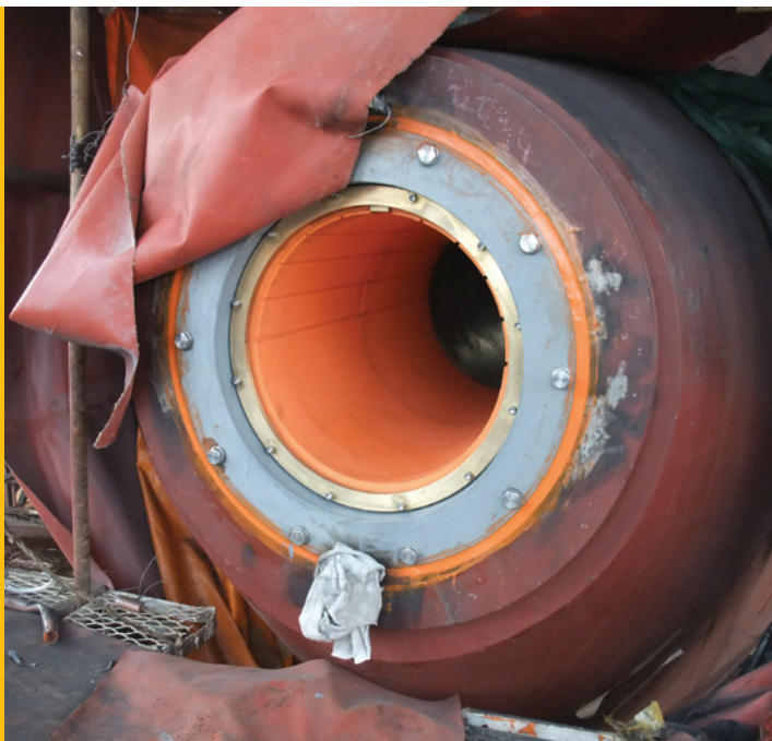
Installation of Thordon COMPAC seawater lubricated propeller shaft bearing on CSL bulk carrier built in China