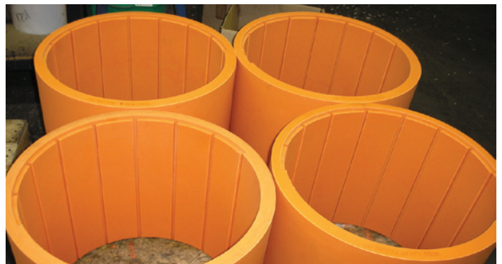
COMPAC bearings ready for installation.

The Vectis Eagle is characterized by its extremely high bow and versatile single cargo hold making it currently the longest cargo space amongst its vessel class. Carisbrooke expects up to 30% reduction in fuel consumption compared to vessels of equal tonnage due to its large diameter propeller and high efficiency nozzle. The ship's design below the waterline is hydro-dynamically optimized to further reduce drag and allow better water flow to the propeller. Careful selection of all chemicals used inboard has been made to ensure the least impact to the environment as possible. NW