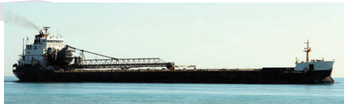
Peter R Cresswell sails on the Great Lakes, Canada

There are over 600 ships equipped with COMPAC water lubricated stern tube bearings, with the first ship converted from oil to water in 1998. Conversions have been on the upswing with four completed in the past six months, including two VLCC's operating out of US waters, a Canadian icebreaker and the Peter R Cresswell . NW