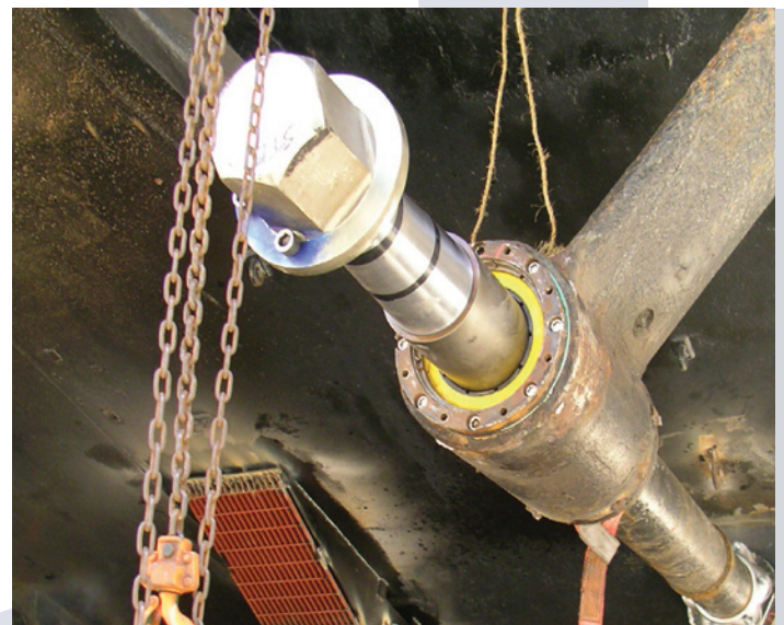
At current wear rates, Thordon RiverTough bearings are expected to last over 10 years

from the river, pumped through the bearings using a Thordon Water Quality Package and returned back to the river. Since no aft seal is required, there is no risk of damage by abrasives or rope. This results in lower in-service maintenance costs and the elimination of storage, sampling and disposal of oil from the stern tube. Mill Log Marine, Thordon's authorized distributor in British Columbia, Canada, has worked with FRPD on this project and continues to advise on problem areas where Thordon solutions may further help them reduce operating costs. NW