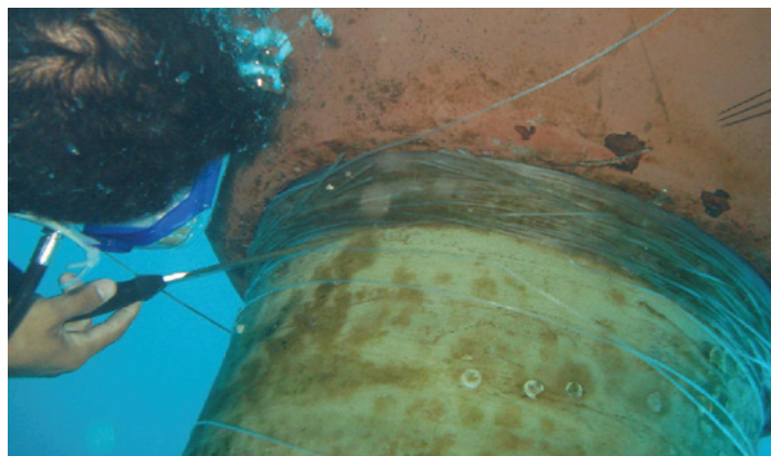
Aft shaft seal damage caused by fishing net caught in the propeller