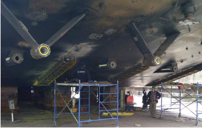
Installation of Thordon RiverTough propeller shaft bearings on the triple screw dredger, Fraser Titan

Installed with RiverTough Propeller Shaft Bearings for Abrasive Waters